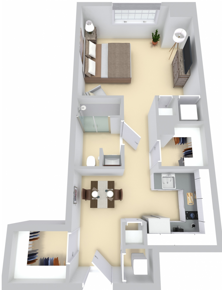
Studio 618 Sq. Ft.

Floor plans are representative; actual square footage, dimensions and details may vary.