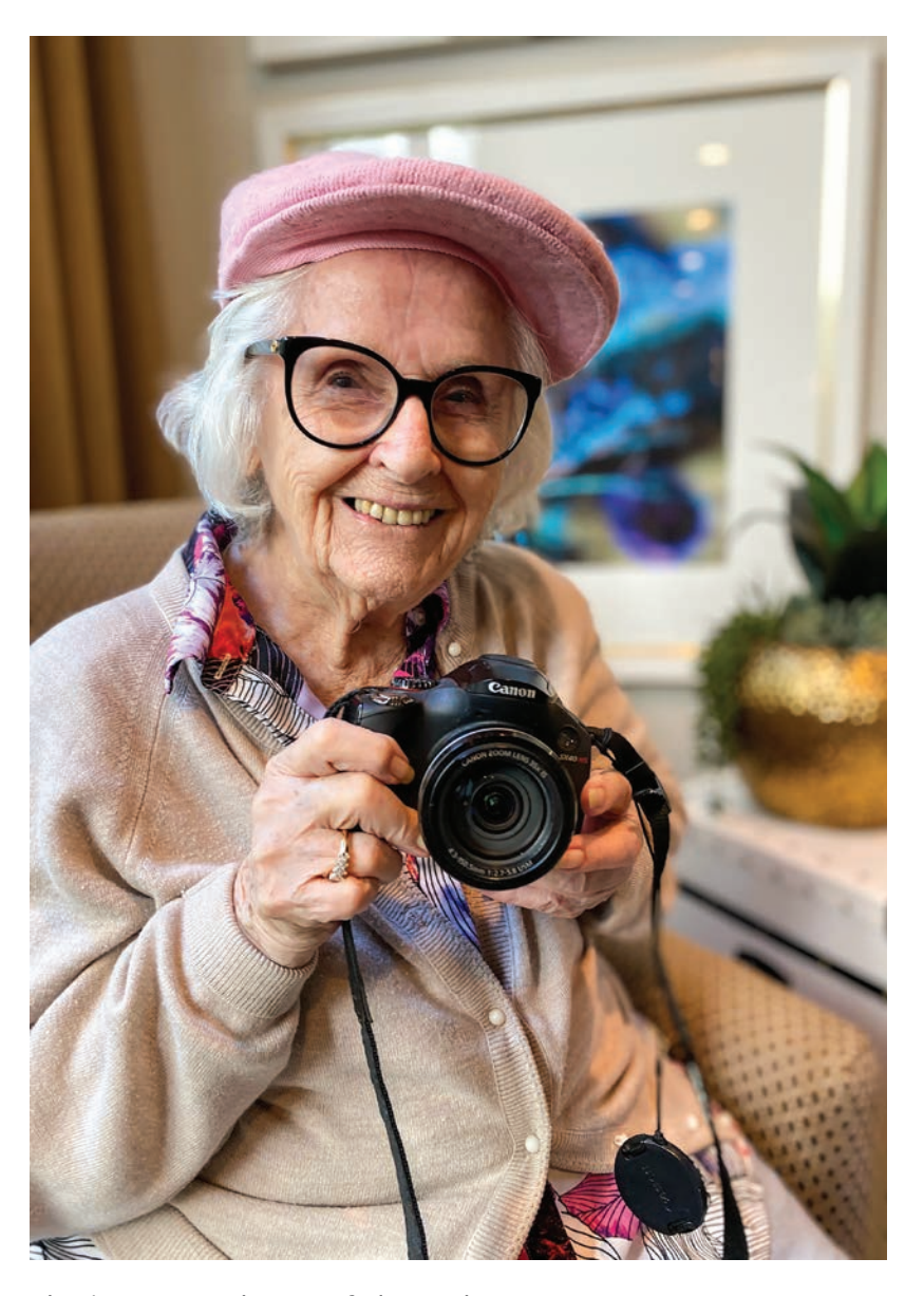
There's a science and an art to feeling good

A program to promote team members' growth through learning opportunities, continuing education, engagement lessons and connection driven by our Power of We ethic. It is how we stay on top of the latest developments and insights, rewarding team members through recognition and scholarship opportunities to create experiences that help our residents connect and flourish every day.