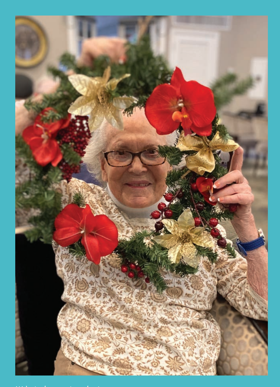
We're in the experience business

By studying trends and generational shifts, and by applying our passion and imagination, SRG remains in a singular position to seize emerging opportunities and answer the call.