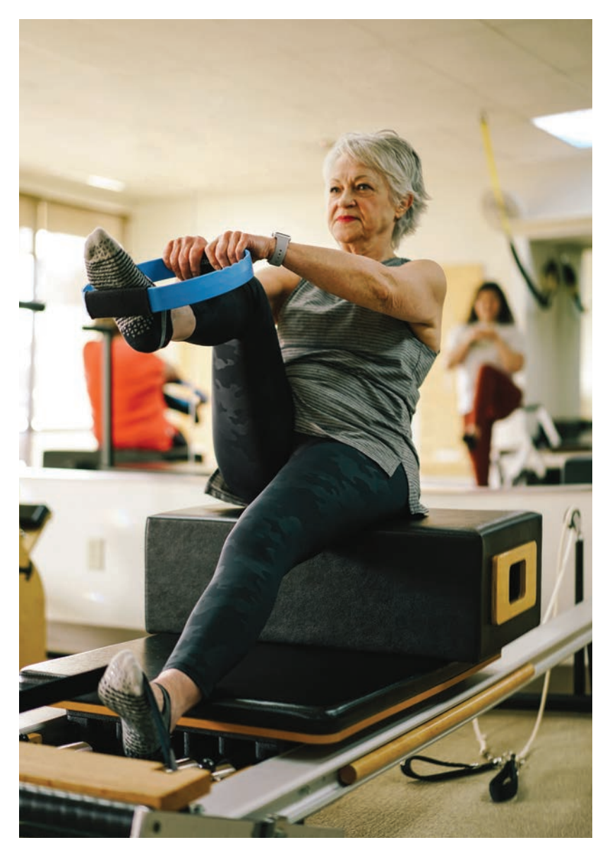
Our ZestFit program makes staying active easy and fun

Through a network of innovative programs and partnerships, SRG senior living communities offer access to personalized and adaptive solutions and services to stay healthier, heal faster and feel better. Health care options feature an onsite clinic as well as respite care and post-hospital care, including a full suite of rehabilitation services from state-of-the-art physical therapy to occupational and speech therapy.