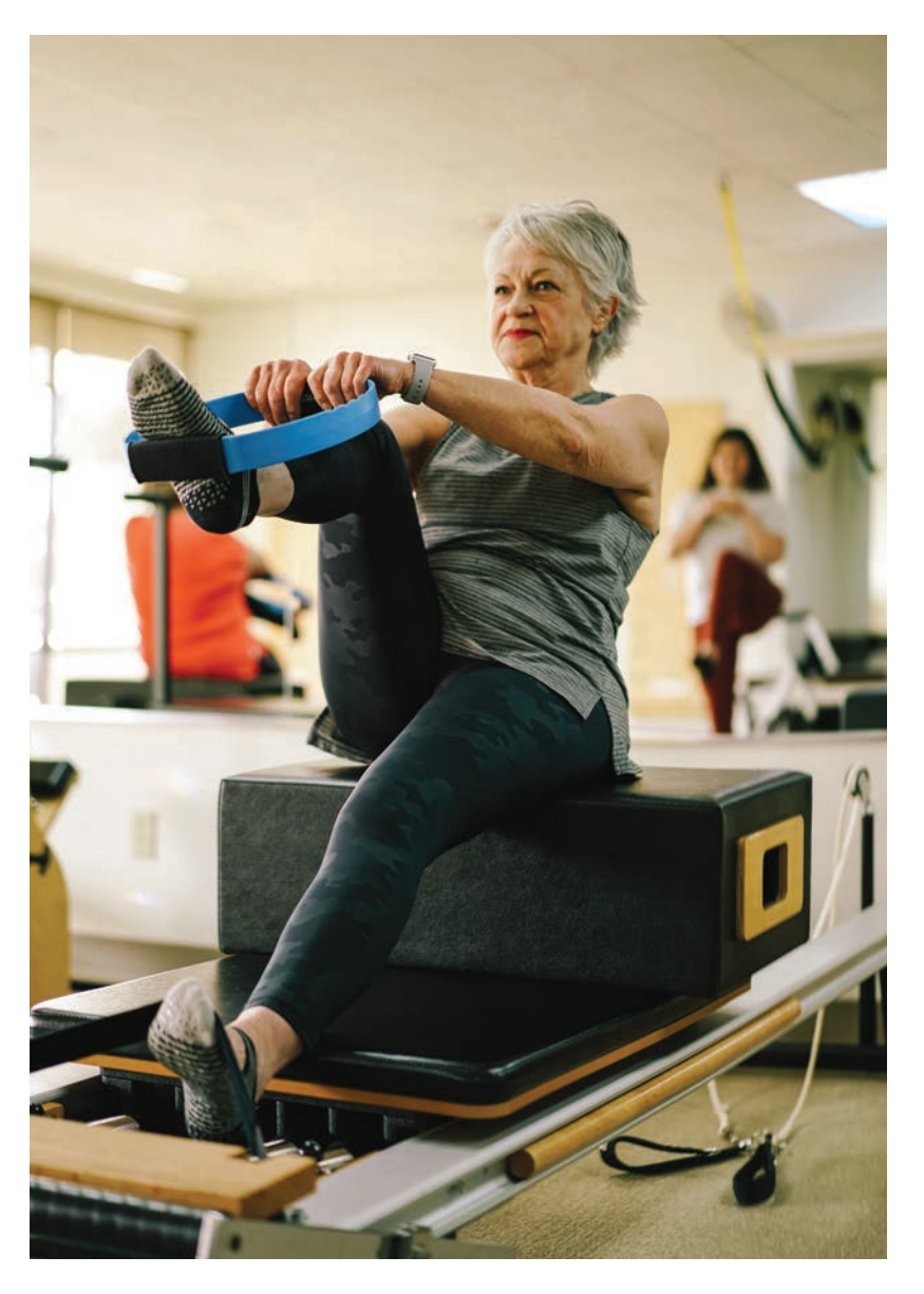
Our ZestFit program makes staying active easy and fun

Through a network of innovative programs and partnerships, SRG senior living communities offer access to personalized and adaptive solutions and services to stay healthier, heal faster and feel better. Health care options feature an onsite clinic as well as respite care and post-hospital care, including a full suite of rehabilitation services from state-of-the-art physical therapy to occupational and speech therapy.