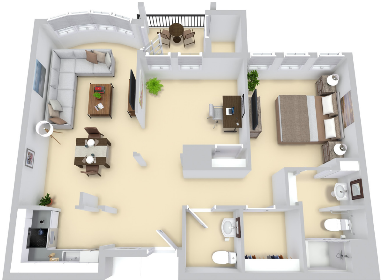
PLAN G 818 SQ. FEET